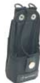
Nylon Carry Case - HLN9701