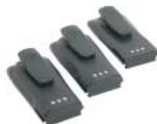
High Capacity Li-Ion Battery, Slim Li-Ion Battery and NiMH Battery - NNTN4497, NNTN4970 and NNTN4851