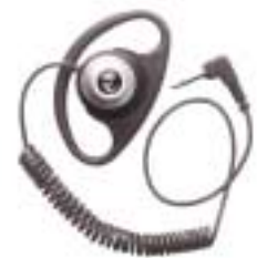
D-Shell Ear Piece for RSM - MDPMLN4620