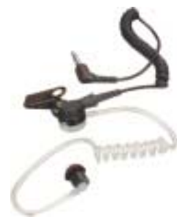
Covert Ear Piece for RSM - MDRLN4941