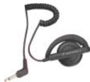
Over Ear Piece for RSM- WADN4190