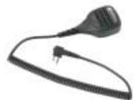
Remote Speaker Microphone with improved noise cancellation capabilities (IP57) - MDPMMN4029