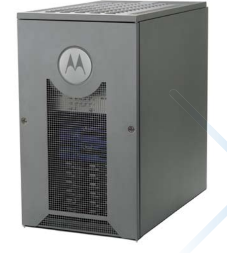
"Dimetra IP Compact delivers a comprehensive, flexible solution and protects your investment with the promise of proven, reliable and comprehensive features"

Dimetra IP Compact's Enhanced System Rack provides a platform designed to meet both current and future communication needs. The scalable architecture enables you to deploy a solution to meet your current operational requirements and when the time is right, add new services or expand your coverage as your business and requirements grow. The Enhanced System Rack supports a wide range of services from telephony and voice recording, through to data services such as Short Data (SDS) for messaging, location and other services, and Packet Data (Single-Slot & Multi-Slot) for higher bandwidth connectivity, enabling rich applications to enhance productivity and access information in the field. Further modules include Security (Authentication and Encryption) to protect information and access to your network, and System Redundancy to enhance resilience to ensure ongoing communications.