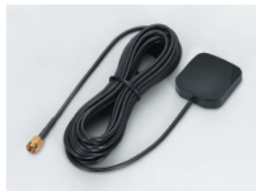
Supplied GPS antenna (5 m)

A built-in GPS receiver with external antenna provides your location, bearing and speed by using information from GPS and GLONASS. The acquired position information can be used for DSC calls.